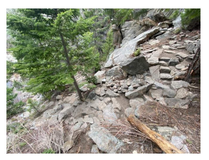
Figure 1- Construction of a primary path out of durable stone material

The Boulder Climbing Community's (BCC) Front Range Climbing Stewards Program (FRCS) has completed a 6-week trail work project in collaboration with Boulder County Parks and Open Space (BCPOS) in the Platt-Rogers Memorial Open Space at what is collectively referred to as Castle Rock. This is the third year of a multi-year partnership between BCC and BCPOS. The primary objectives for this project were to address the impacts of climbers and other recreationists accessing the Broken Rock and Overlook climbing areas across from Castle Rock proper.