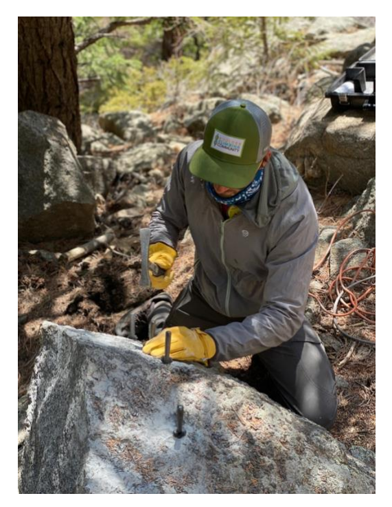
Figure 2- BCC staff using feathers and wedges to quarry stone.