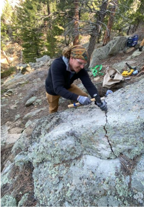
Figure 2- BCC staff using feathers and wedges to quarry stone.