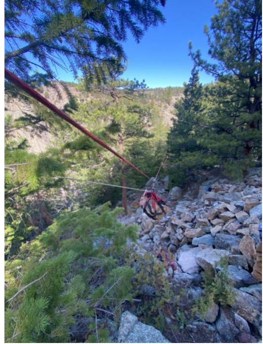
Figure 3- BCC staff utilized a high line rigging system to transport large amounts of stone to the build sites.