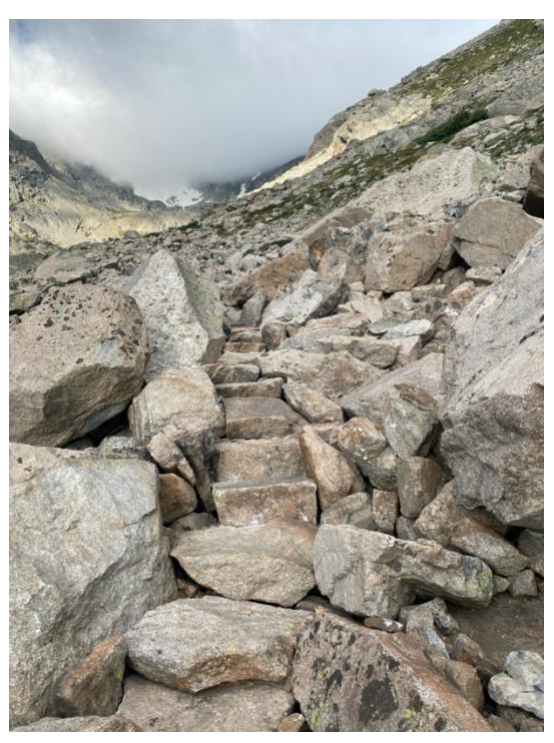
Figure 3: Stone staircase constructed without shaping or manufacturing stone.