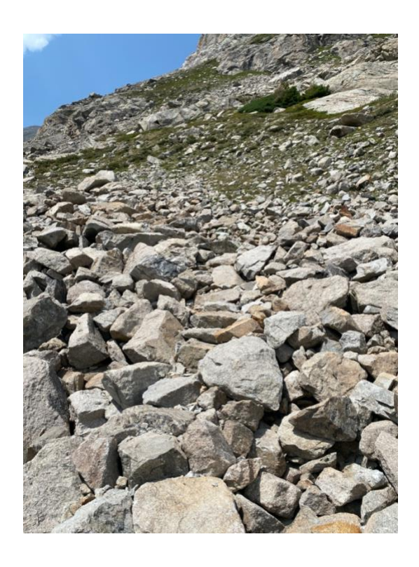
Figure 2: By shifting the talus to the side and either creating pads with aggregate material or "paving" withs stone, FRCS was able to construct a primitive trail that is easy to walk on but blends well into the talus.