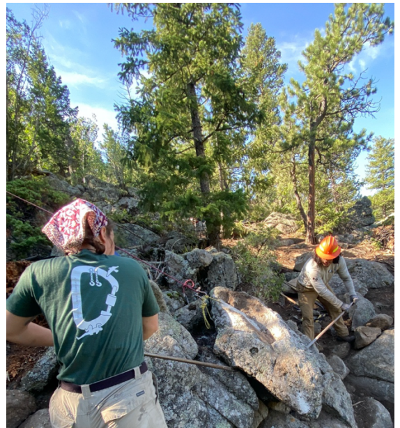
Figure 1: RMC crew learning how to move large rocks

The Boulder Climbing Community's (BCC) Trail Program has completed 5-weeks of trail work on the Oceanic Wall Approach trail at Upper Dream Canyon. This completes the final section of the project which has been one of the BCC's most ambitious self-funded trail projects that was started in 2018. This multi year long project established long term access to the Oceanic wall by constructing a new climbing access trail on USFS(United States Forest Service) land and away from private property where the previous trail had been located. The BCC was tasked with designing and constructing the new trail along with providing training and supervision for the RMC (Rocky Mountain Conservancy) which has worked alongside the BCC the last three years. This project was funded by the BCC with help from Colorado Parks and Wildlife (CPW), The American Alpine Club (AAC), The Access Fund, Athletic Brewing, Movement Climbing and Fitness, REI Co-op, and Colorado Mountain Club (CMC).